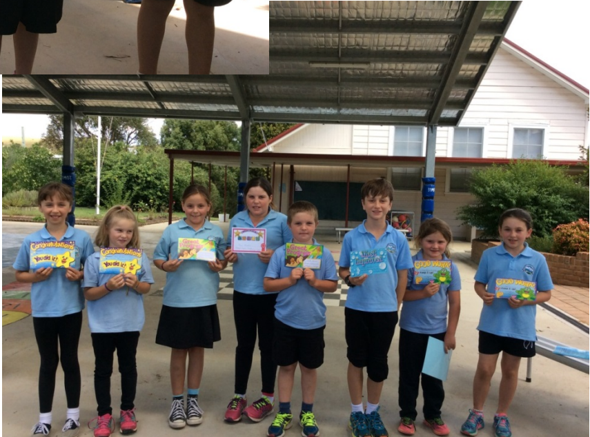
Dalgety Bridge Opening - 14/3/2016