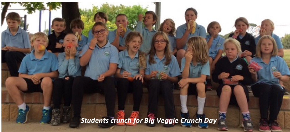
Students crunch for Big Veggie Crunch Day

Our 'Healthy Snack' (as part of the Live Life Well at School program's Crunch & Sip initiative) has become a morning ritual and has been enjoyed by students, providing them with that little bit of extra 'fuel' for the morning Literacy session.