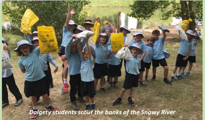
Dalgety students scour the banks of the Snowy River

Armed with garbage bags, students eagerly set out for the annual clean-up day on Fri 2 March. Starting at the school, we did a quick clean up (very little due to the school being spotless anyway) and then moved into and around town, scouring for bits n pieces of rubbish. We left happy and fulfilled, and our town spotless - something to be really proud of.